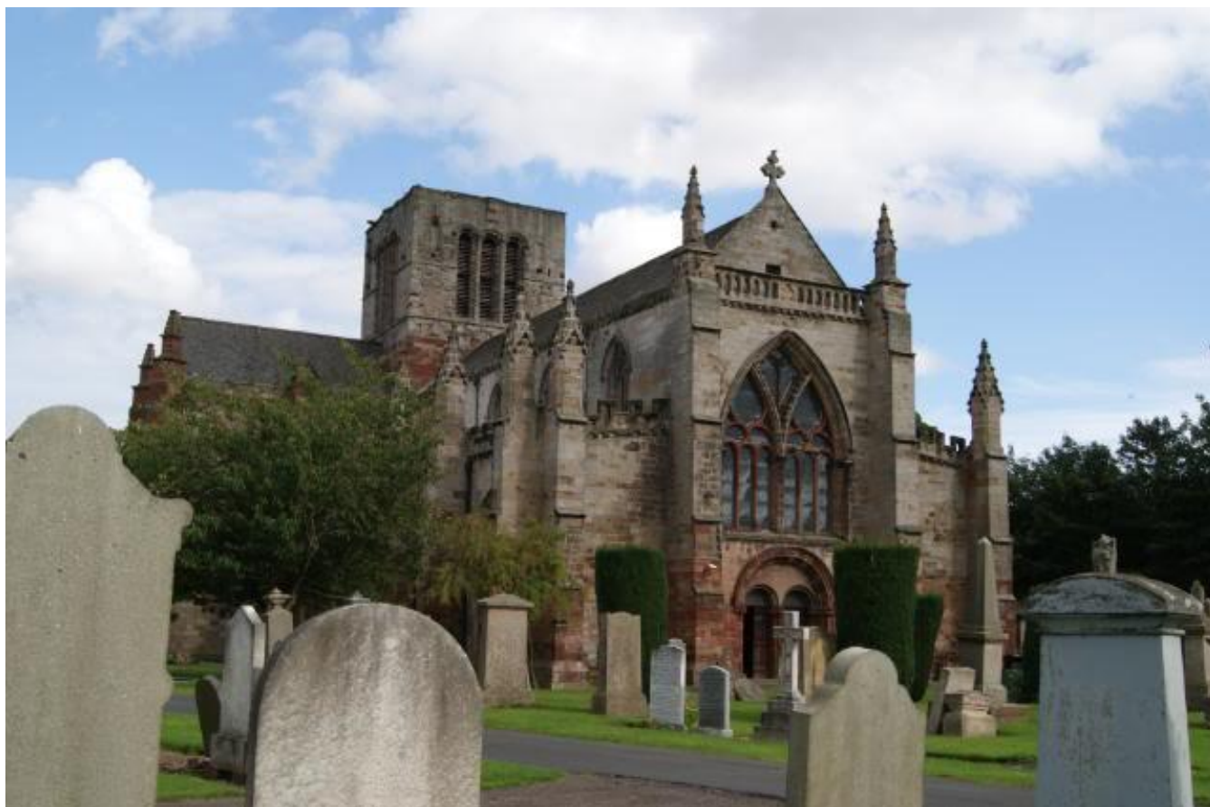
St. Mary's Church, Haddington

Haddington Cemetery contains 12 Commonwealth War Graves – all relating to World War 1.